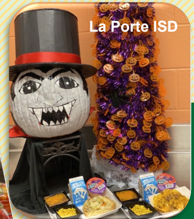
La Porte ISD

Mission CISD and La Porte ISD combined Halloween and the Farm Fresh Challenge with these display trays featuring local products